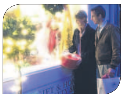
FREDERICKSBURG DEPT. OF ECONOMIC DEVELOPMENT AND TOURISM

MINI-EXCURSIONS BLEND SHOPPING AND GOOD TIMES ..... 6