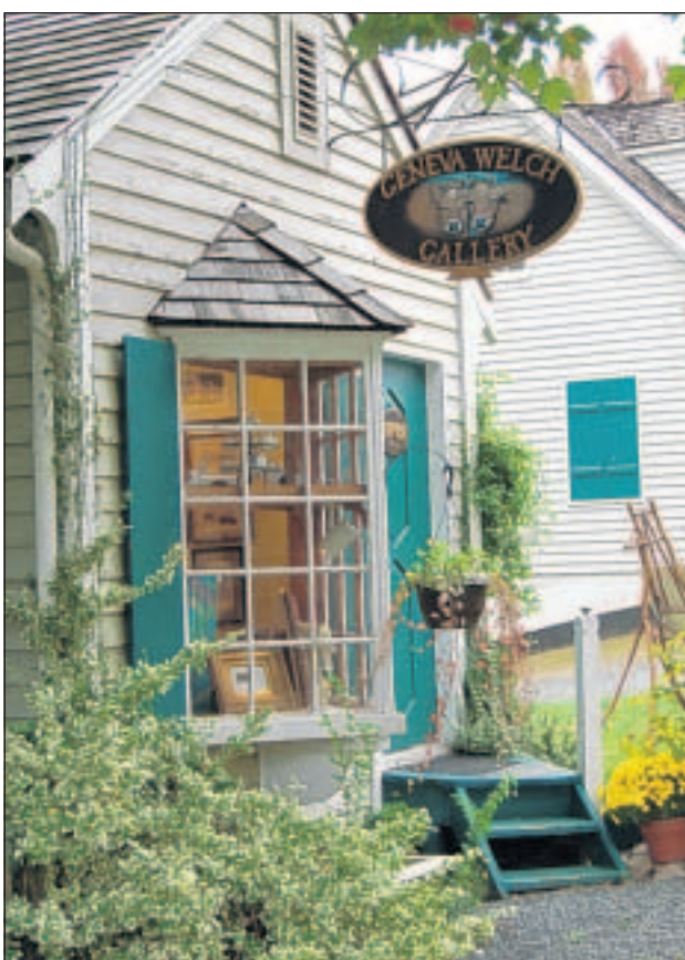
Galleries and shops in Little Washington offer quite a range of goods, from Americana to exquisite jewelry. Nearly every corner has another place to discover.