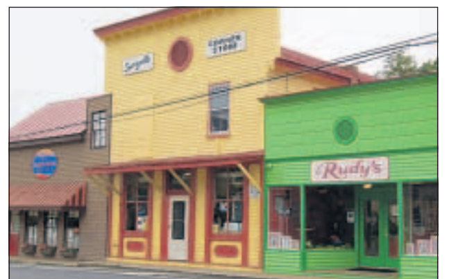
More galleries and shops line the streets of Sperryville.