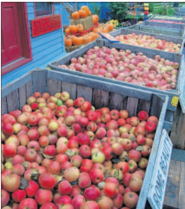
Travel to and from Little Washington is itself a treat, with plenty of roadside stands offering local produce, honey, homemade jams and more. Here, bins of apples entice visitors.