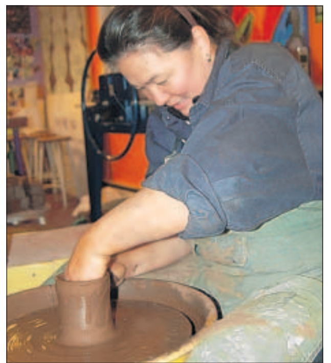
Potters demonstrate their craft at Sperryville Pottery.

Fine jewelry for all occasions is hand-forged on site at Goodine's Designs in Gold and Silver. Prices range from $25 to $5,000.